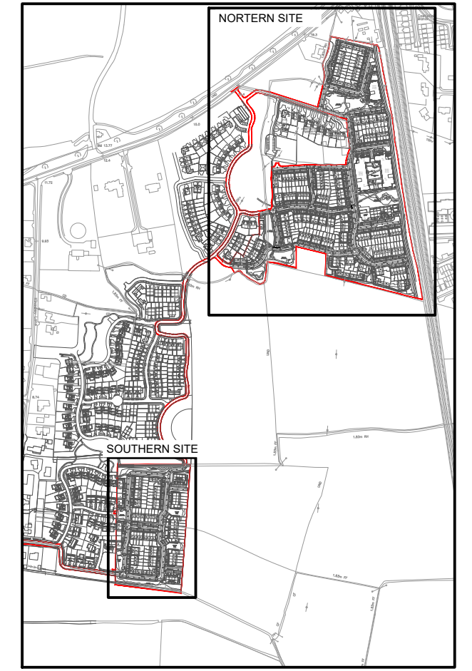
KEYPLAN PLAN SCALE 1:5000